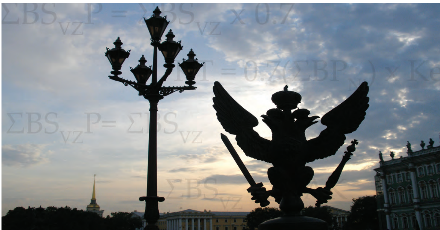
Statue of the Russian double-headed eagle that is part of the Russian Federation's coat of arms. Saint Petersburg, Russia 3

As with all operations research-related techniques, COFM's focus is toward the ultimate "goal" of a particular task—specifically, the direct numerical comparison of forces. Its principal mechanisms are (1) the quantification of selected battlefield elements, and (2) the mathematical expressions (or formulae) that relate those elements in such a manner to support decision making. These mechanisms are used to develop conclusions about the status of opposing combatants at particular stages of the unfolding battle. 2