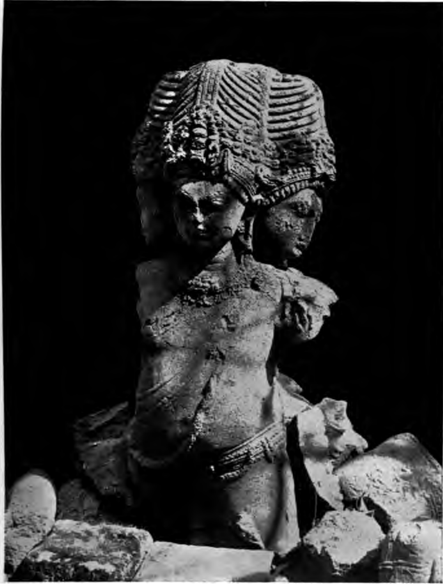
Brahmā. Brahmanical stone sculpture, Elephanta, 8th Century.