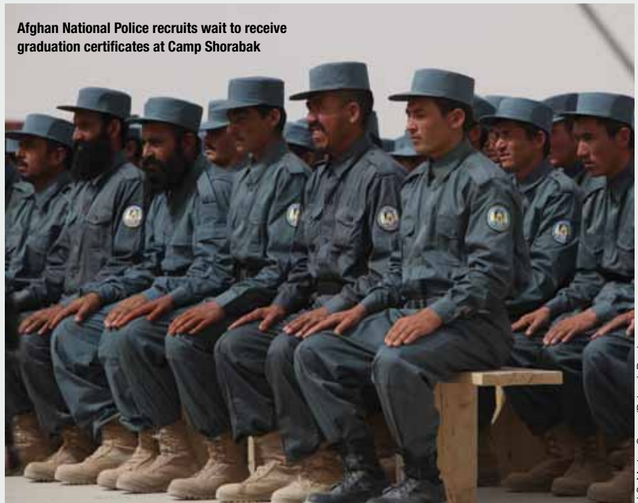
Afghan National Police recruits wait to receive graduation certificates at Camp Shorabak

scope of the primary threat from al Qaeda, the group’s inflammatory and threatening rhetoric suggests that the disruption, dismantling, and ultimate defeat of the network are still a viable goal. So the question remains: how is it possible that the