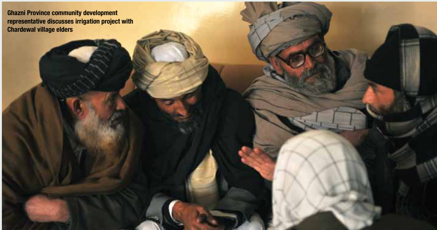
Ghazni Province community development representative discusses irrigation project with Chardewal village elders

Given the complex nature of COIN, and the vast resources it requires, it seems only logical that the administration’s Afghanistan